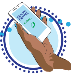
Call your local medical centre to make an appointment first