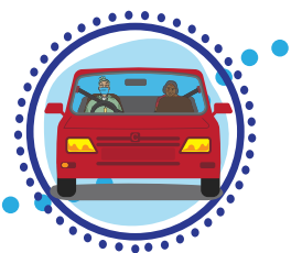
Keep your distance from others including the driver

The staff at your clinic will tell you what to do. Listen carefully to their instructions.