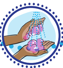
Wash your hands regularly